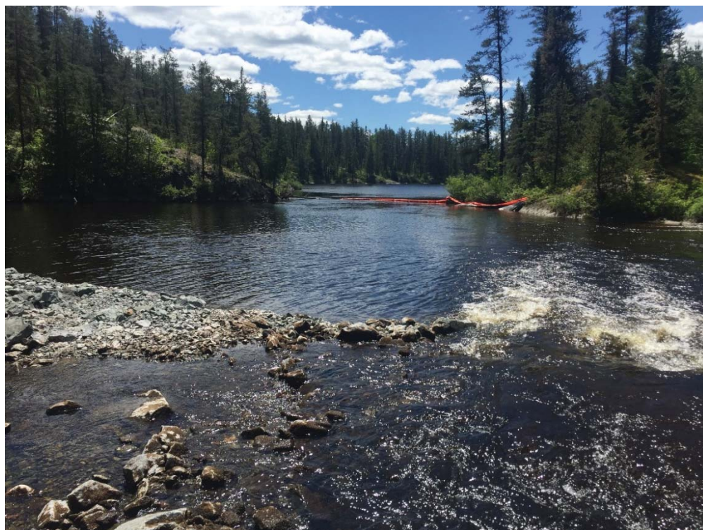
Photo 3. Looking east from the outlet of the culvert