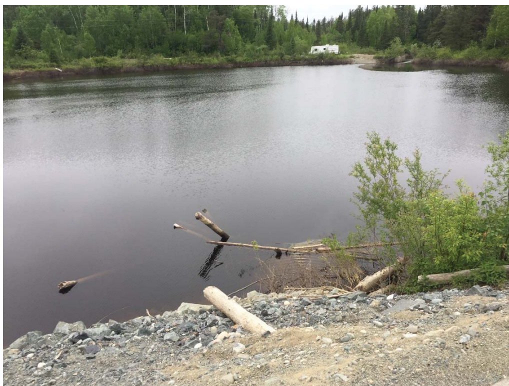
Photo 4. Looking west from the inlet of the culvert