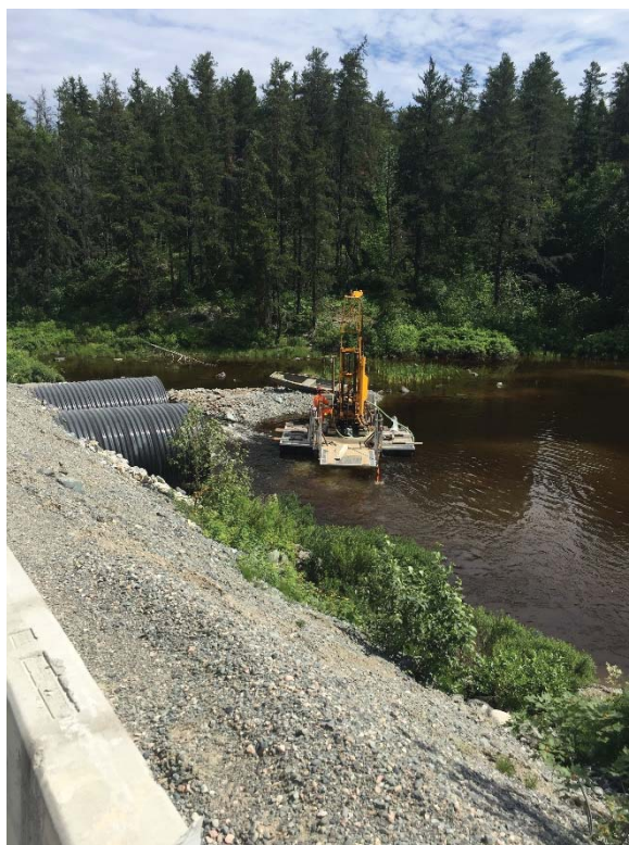
Photo 15. Borehole BH-1 drilling using a barge