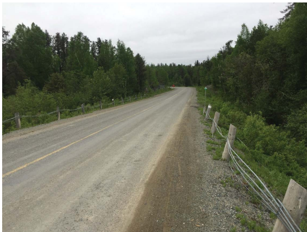
Photo 1. Hwy 672, looking north