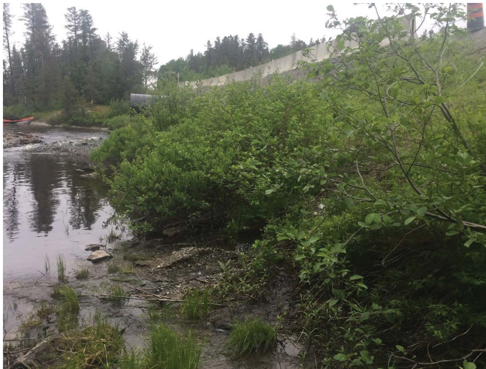
Photo 12. Water seepage through east(outlet) side of embankment north of existing culvert