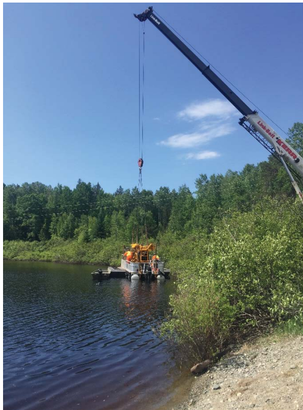
Photo 14. Crain lifting of barge and rig and placing them in water