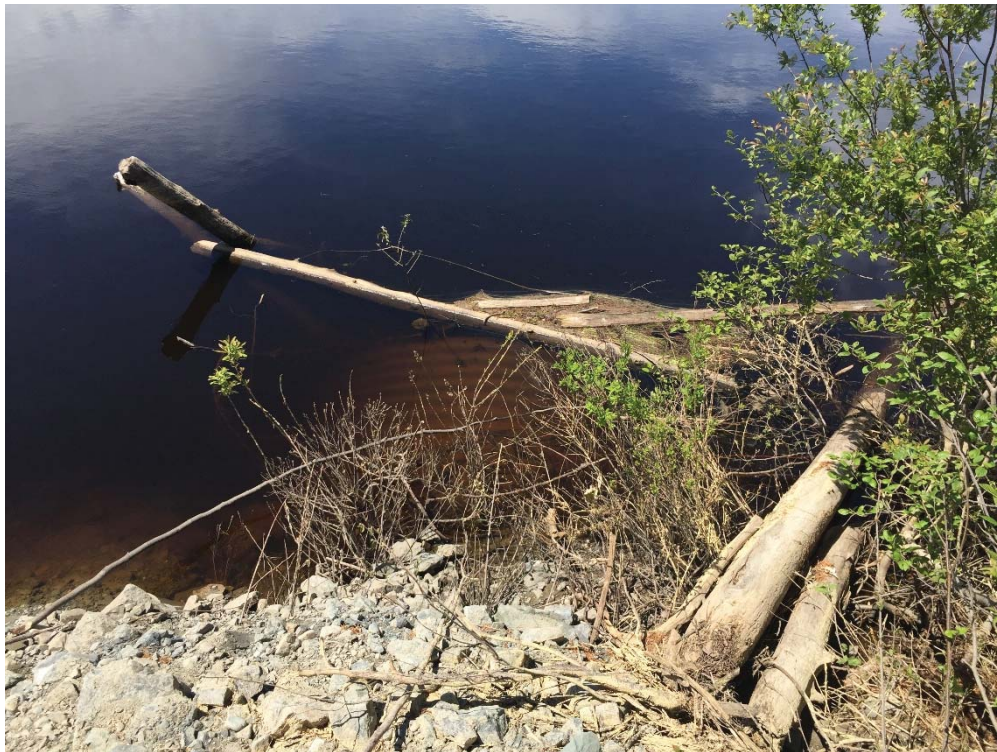
Photo 10. Submerged inlet of existing culvert during Phase I investigation on June 2017