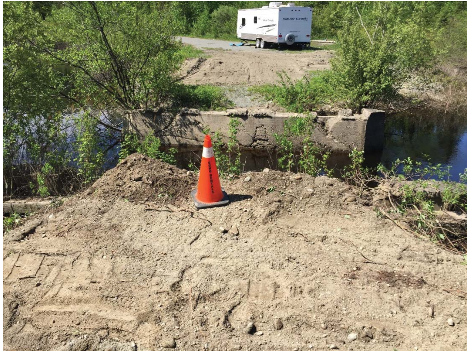
Photo 13. Temporary modular bridge location looking south, note existing abutment